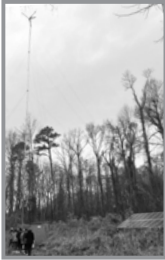
The off-grid guest house is powered by solar panels and a wind turbine.