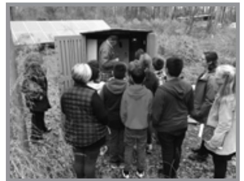
Roger Gruben shows students the power controls for the off-grid guest house.

It was nearly 5 p.m. just days before the winter solstice.