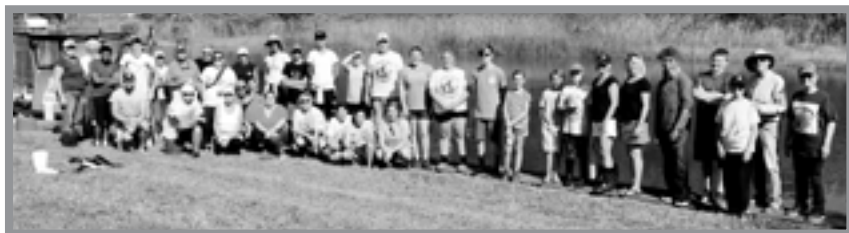
50 volunteers participated in this year's creek cleanup.